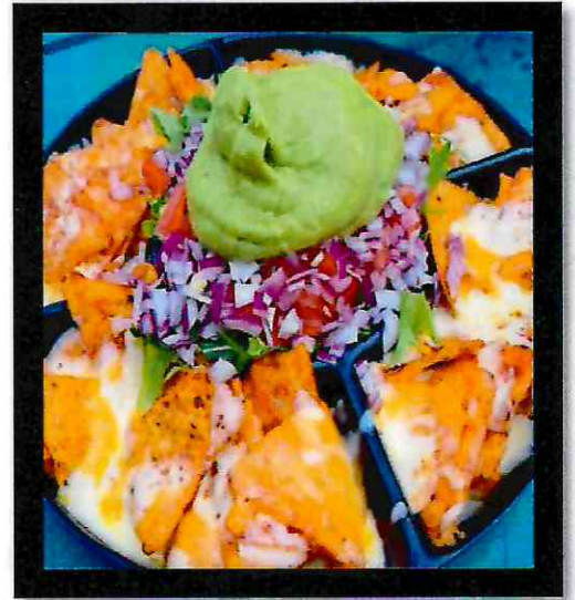
Chicken Livers - Hot/Plain-R65