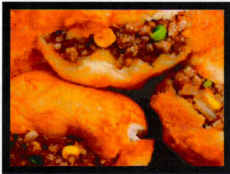
Mayo Chicken /Curry Mince