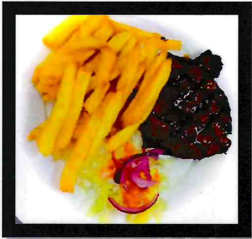
T-Bone 500g -R150