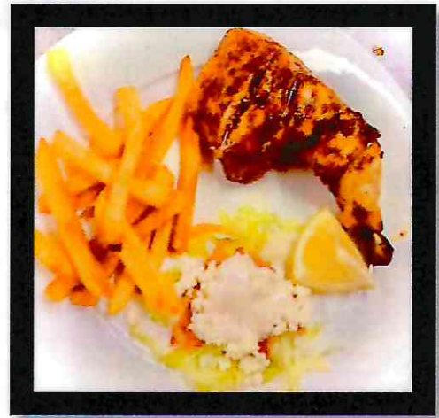
Rump 350g -R140