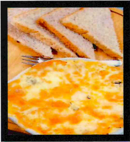
Crumbed Mushrooms -R70